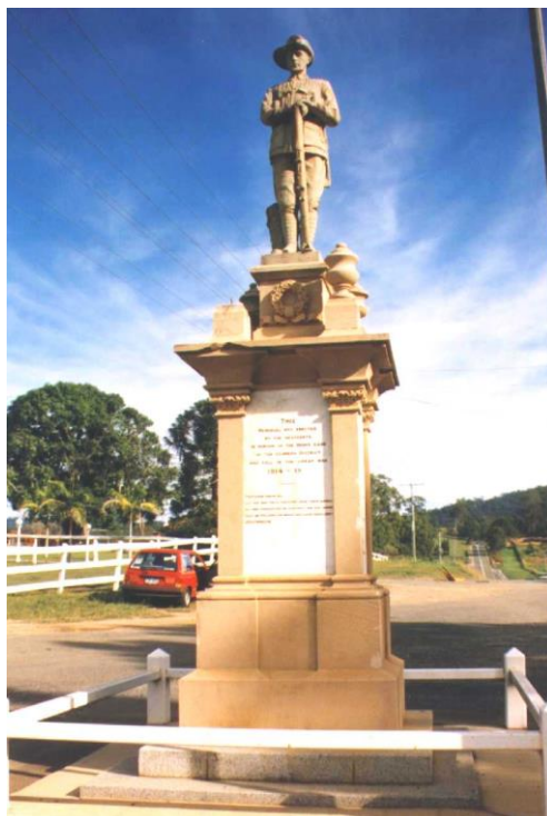
Upper Coomera War Memorial