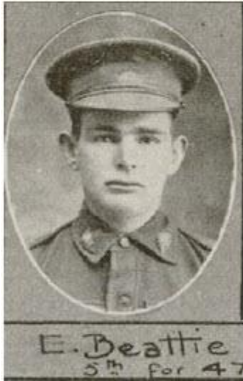
(Queenslander Pictorial - 7 October, 1916)