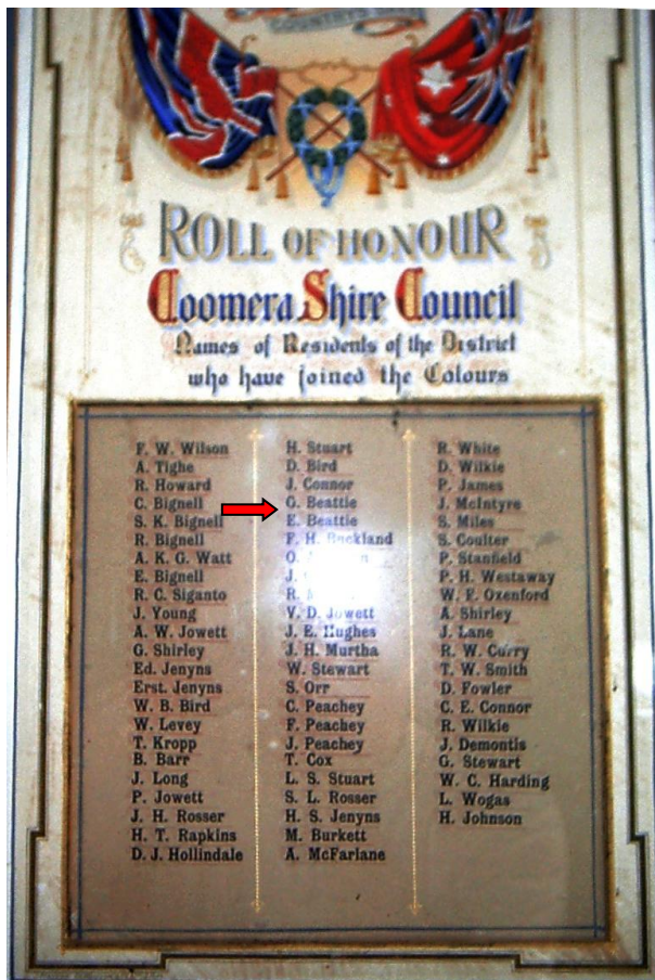
Coomera Shire Council Honour Board